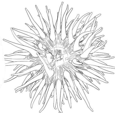
Dahlia anemone Urticina felina